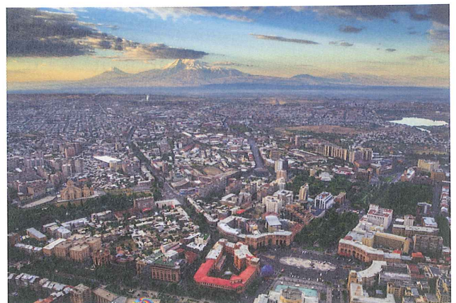
Panoramic view of Yerevan

Those visitors that are tired of the noise of big cities and urban life can always find a tranquil paradise in the beautiful nature of Armenia. The country not only is a wonderful place for trekking and hiking but it is a hidden jewel for the lovers of extreme tourism, that can profit from its numerous mountains and zip-lining, off-road driving, paragliding facilities.