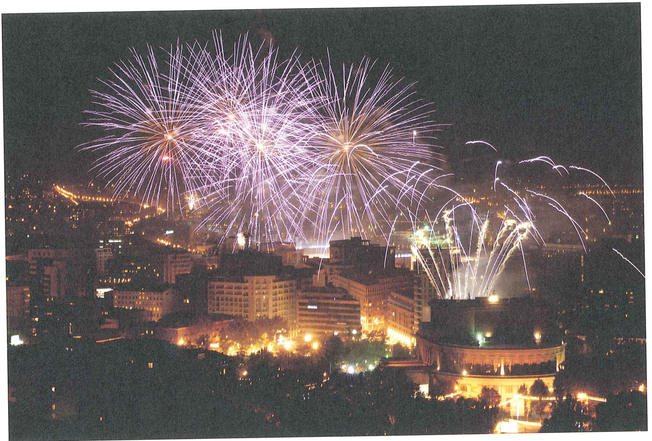
Yerevan at night

software, multimedia, web design, information systems, system integration.